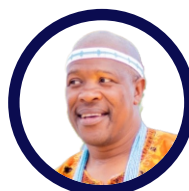
Prince Manene Tabane National Convenor, ROLESACIBA's

CIBA's Traditional Royal Charter and what that means for Accountants