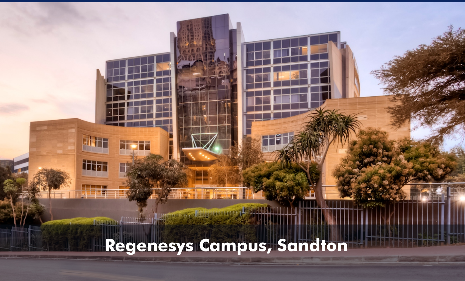
Regenesys Campus, Sandton