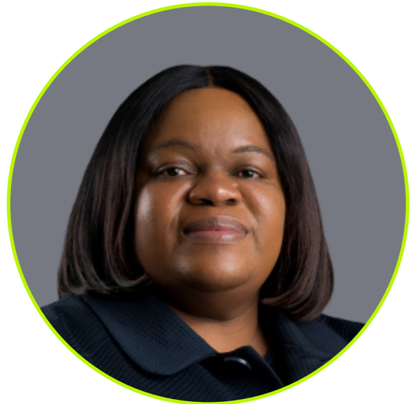
Keynote Speaker Hon. Lucia Lipumbu Minister of Industrialisation and Trade, Namibia