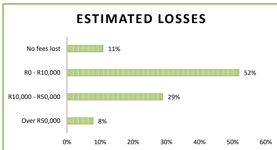
Diagram 2. Estimated losses suffered by members due to the industrial strike action

R10,000 with 29% had suffered losses more than R10,000.