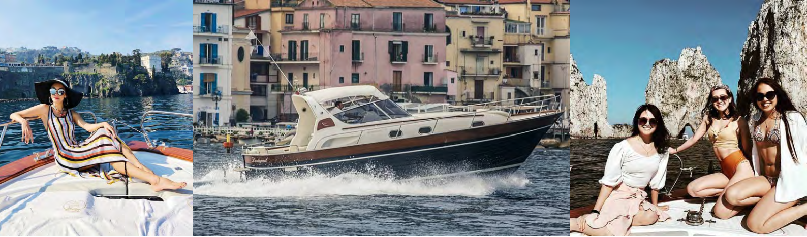
Port of Naples: Harbour Beverelo

The Summit concludes at 13:00, followed by a cocktail event. Delegates may opt not to attend the last sessions and reserve an Island boat tour at an additional fee, before we depart to Naples per ferry.