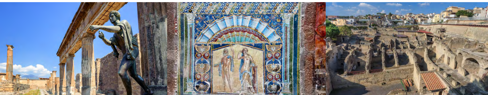
Pompeii, Vesuvius, Herculaneum