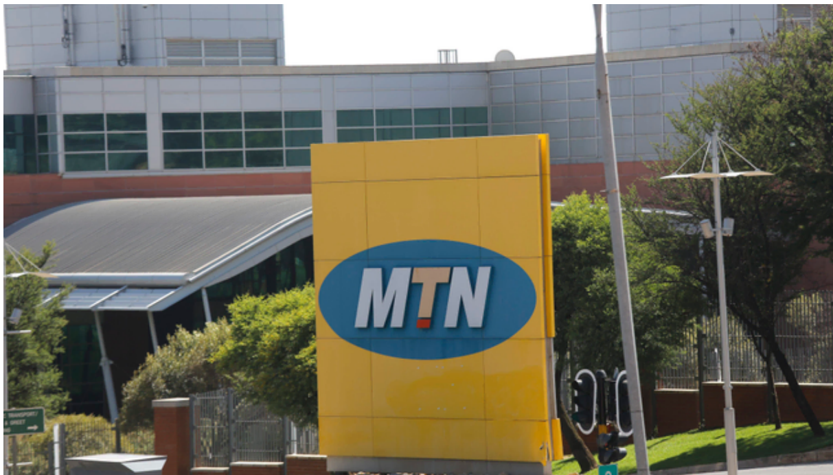
MTN is the latest company in South Africa to issue a vaccine mandate.